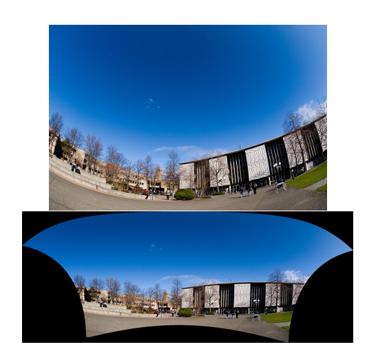
Figure 12: Automatically remapping an image from a Fisheye lens to Lambert Equal Area (the original is above).

With a fast enough processor these corrections could happen in the camera, in real time, and the user could preview them using the camera's LCD display. These might be features that one day become common in our digital cameras. The ability to record pitch and roll by the camera has also important legal implications. Our brains rely on visual clues to determine where the horizon is, and what corresponds to vertical [LT04]. When those clues are manipulated, an image might be interpreted by its viewer differently from the reality that it corresponds to. We also envision a future in which a camera will record GPS coordinates (this is already possible), pitch and roll and orientation with respect to the North