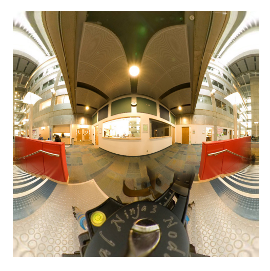
Figure 5: Adams World in a Square 1. There is emphasis in the poles while maintaining the areas closer to the horizon. The tripod used to take these photos is clearly discernible. Compare this image to figure 1.

Adams presented his projections in 1925 [Ada25]. They present the entire sphere in a conformal manner. The I exaggerates the size of objects along the poles but it is otherwise a good representation of the viewable sphere. The II presents the world in a square that is rotated 45 degrees. Both can be tessellated, with aesthetically interesting results. Figure 5 shows how the poles are well represented with this projection.