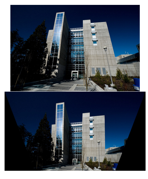
Figure 11: Correcting perspective. The corrected image pre serves parallel lines as parallel. (the original is above)