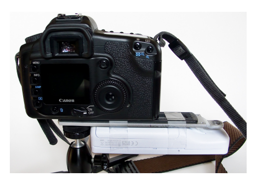
Figure 9: The Wii Remote mounted under a Canon 20d camera using the tripod socket.

Our experiments indicate that the values returned by the accelerometers vary from -20 to +20 (once we have normalized the value 0 to the horizon), corresponding to -45 to 45 degrees; the values are evenly spaced), giving a maximum theoretical precision of approximately 2.25 + 1.12 degrees.