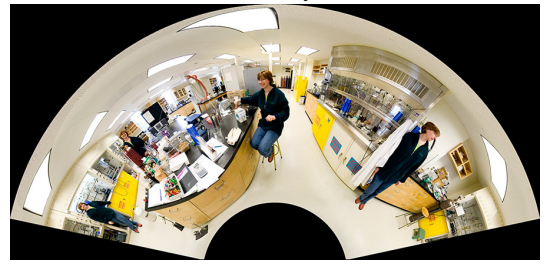
Albers Conical Equal-Area (with parameters 0 and 60)