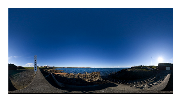
Figure 6: Architectural projection. The horizon has been shifted from the middle to almost 30% from the bottom of the image.

Figure 7 shows the interior of the Reims Cathedral using the architectural projection. Figure 8 shows the same panorama using the equirectangular projection.