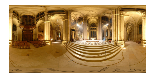
Figure 8: Equirectangular projection of the image in figure 7. Equirectangular is the most commonly used projection to display full spherical panoramas. The floor occupies a large area, but the ceiling is compressed.

stereographic image (stereographic fisheye lenses–which are conformal–are perceived to create a more pleasant image than fisheyes, but are difficult to manufacture) and is known as "defishing". Several software applications are available in the market to perform this transformation automatically. The fisheye image is automatically "defished" into a rectilinear projection where the center of projection is the same in both.