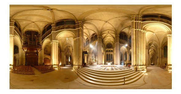
Figure 7: Architectural projection, which highlight the detail in the ceiling more than the floor. Compare this image with figure 8.