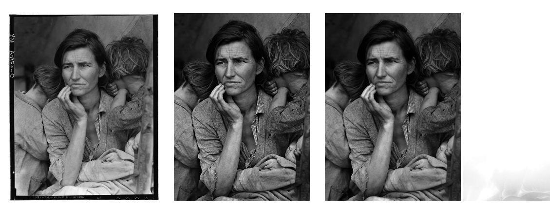
Figure 12: Migrant Mother, 1936, by Dorothea Lange; in the public domain. The image corresponds to the scan of the 4x5 negative done by the Library of Congress of the United States (LC-DIG-fsa-8b29516). The base print is significantly lower resolution and was created by Mike Johnston [Joh06]. The third is the dodged-and-burned matched print (using the scaling method). The final image is the unblurred burned mask. Notice how the bottom of the image has been darkened. The image required no significant dodging.

images. United States Patent 6456732, Sept 2002. Assignee Hewlett-Packard Company.