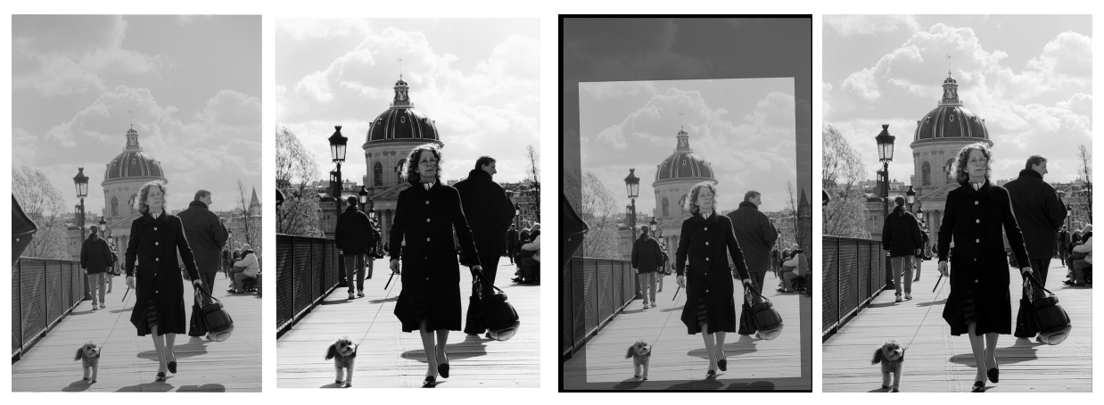
Figure 3: Crossing Pont Neuf by D.M.German, used with permission. The first image is the negative and looks flat. The second is the base print and shows lack of detail in the shadows (i.e. dress under her coat) and highlights (areas of the sky). The third shows the computed cropping, when applied to the negative. The last image is the matched print. Notice how the shadows and highlights have been recovered, while maintaining the overall contrast of the base print.