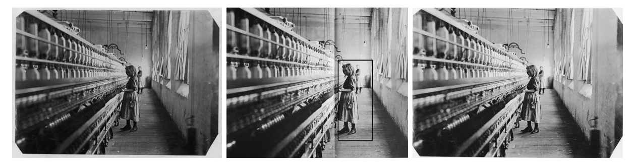
Figure 5: Sadie Pfeifer, 48 inches high has worked half a year. (1908) by Lewis Hine; in the public domain. An example of a matched print created using only a section of the original image as the base print. The image on the left corresponds to a scan of a print by the Library of Congress (nclc 01455). The one in the middle is a scan from a book [Kot05] (a double page spread, hence the darker area in the middle; it has been slightly blurred to reduced the effect of halftoning printing). Only the boxed area is used as the base print. The one on the right is the matched print.