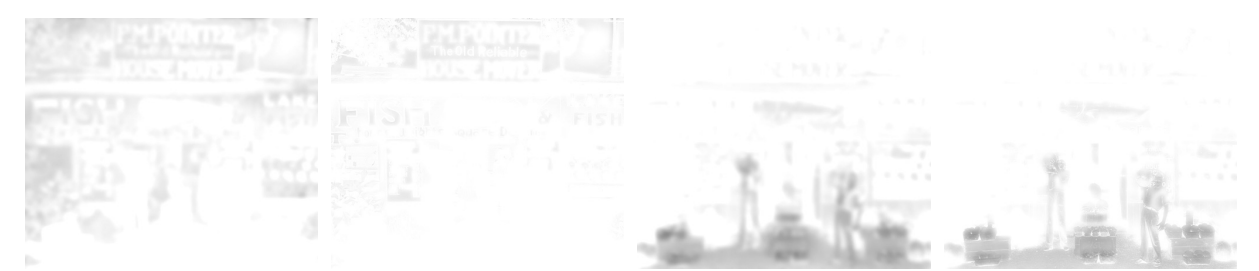
Figure 11: Dodging (left) and burning (right) applied to the matched print (blurred and unblurred). The dodged version is presented as the absolute value of pixels below zero, and the burned as the positive values only. Notice in particular how the burning applies mainly to the foreground and the two kids, while the dodging tries to brighten the rest of the print. For presentation purposes the pixels in these masks have been inverted: white means no contribution, and black full contribution