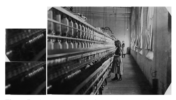
Figure 7: The scan from the Library of Congress has water damage in the bottom left corner (see Figure 5). Fortunately it is an area of low detail. A region from the scan from [Kot05] (depicted also in Figure 5) is used to restore it.

Figure 6: Algorithm to restore an image base using image i. selectRegionToRestore could be implemented automatically by first matching both prints (using match-Print) and then computing areas in which they differ significantly; or manually, with the assistance of an operator. blend takes both the matched region to restore, and the base print, and combines them without a visible seam (it can be implemented using an algorithm such as [Aga07]).