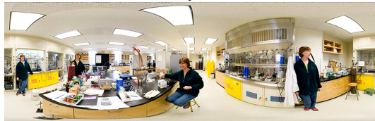
Lambert Cylindrical Equal-Area