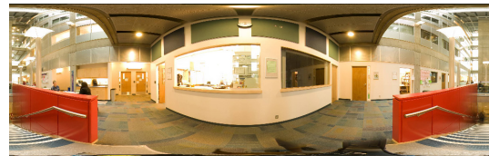
Figure 1: Lambert Cylindrical Equal Area. The poles are compressed and the emphasis is in the area in the middle. Compare this image to figure 5; the tripod used to take these photos is not recognizable.

One of the main disadvantages of cylindrical projections is that they expand the areas close to the poles. In many panoramas this space is of no particular interest (corresponding to the floor, and the nadir—either the ceiling or the sky). The main advantage of the Lambert Cylindrical Equal-Area (presented by J.H. Lambert in 1772) is that it compresses these regions. This also becomes its main disadvantage: the zenith and the nadir are usually unrecognizable. Figure 1 shows the use of this projection, in which the poles are highly compressed. We believe that it can be used to present a reasonable view of an interior room of normal height that has no special features in the ceiling or the floor. It can present the entire sphere, and its aspect ratio is 3.14, making it the most oblong of all the projections. Its forward, and inverse formulae can be found in [Sny87]. We propose the Lambert Cylindrical Equal-Area as a replacement of the Sinusoidal as an efficient storage and transmission format for panoramas due to the following reasons: