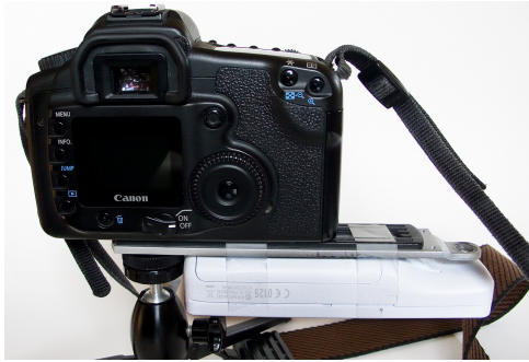
Figure 9: The Wii Remote mounted under a Canon 20d camera using the tripod socket.

Our experiments indicate that the values returned by the accelerometers vary from -20 to +20 (once we have normalized the value 0 to the horizon), corresponding to -45 to 45 degrees; the values are evenly spaced), giving a maximum theoretical precision of approximately 2.25 \pm 1.12 degrees.