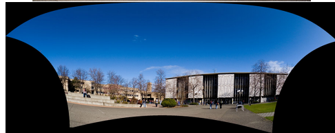
Figure 12: Automatically remapping an image from a Fish-eye lens to Lambert Equal Area (the original is above).

With a fast enough processor these corrections could happen in the camera, in real time, and the user could preview them using the camera’s LCD display. These might be features that one day become common in our digital cameras. The ability to record pitch and roll by the camera has also important legal implications. Our brains rely on visual clues to determine where the horizon is, and what corresponds to vertical [LT04]. When those clues are manipulated, an image might be interpreted by its viewer differently from the reality that it corresponds to. We also envision a future in which a camera will record GPS coordinates (this is already possible), pitch and roll and orientation with respect to the North