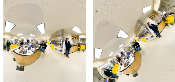
Adams World in a Square I and II