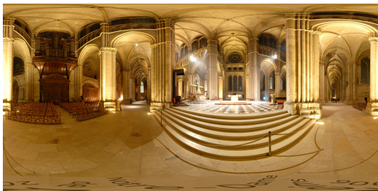
Figure 8: Equirectangular projection of the image in figure 7. Equirectangular is the most commonly used projection to display full spherical panoramas. The floor occupies a large area, but the ceiling is compressed.

stereographic image (stereographic fisheye lenses—which are conformal—are perceived to create a more pleasant image than fisheyes, but are difficult to manufacture) and is known as “defishing”. Several software applications are available in the market to perform this transformation automatically. The fisheye image is automatically “defished” into a rectilinear projection where the center of projection is the same in both.