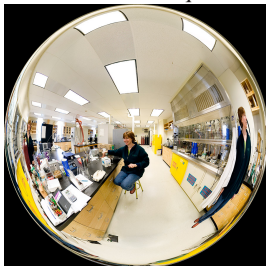
Lambert Azimuthal Equal Area