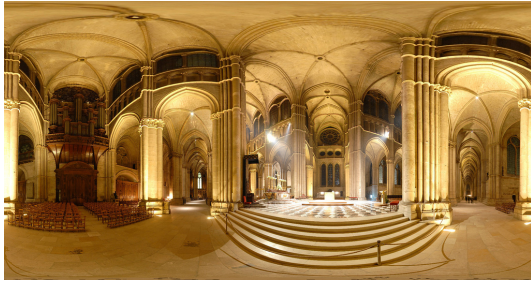
Figure 7: Architectural projection, which highlight the detail in the ceiling more than the floor. Compare this image with figure 8.