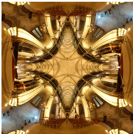
Figure 4: Tessellated Peirce. Image ©S. Pérez-Duarte; mapped by D.M. German. Used with permission.

It was the first map projection that used elliptical functions [SV89]. In its normal aspect this projection resembles an azimuthal (it is centered around the nadir). It is conformal except at 4 points where the horizon crosses the meridians at 0, 90, 180, and 360 degrees. Aside from being conformal, the Peirce Quincuncial has two important features: first, it preserves area better than the Mercator and the stereographic; second, it can be tessellated an infinite number of times. This second property has a tremendous potential for artistic purposes. The complex curves convert the straight lines in the sphere as smooth curves that are have a very pleasant periodicity. Figure 4 is an example of an sphere projected to a Peirce, tessellated 4 times and then cropped to increase its aesthetic impact. We expect the Peirce to have a similar impact to that of the stereographic in the creation of aesthetically interesting panoramas.