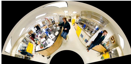
Albers Conical Equal-Area (with parameters 0 and 60)