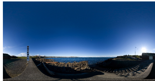
Figure 6: Architectural projection. The horizon has been shifted from the middle to almost 30% from the bottom of the image.

Figure 7 shows the interior of the Reims Cathedral using the architectural projection. Figure 8 shows the same panorama using the equirectangular projection.