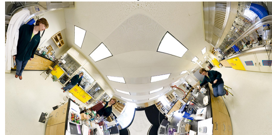
Adams Hemisphere in a Square (for both hemispheres)