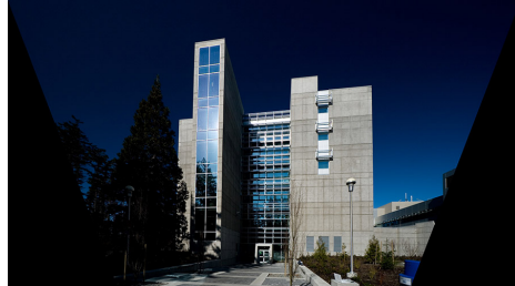
Figure 11: Correcting perspective. The corrected image preserves parallel lines as parallel. (the original is above)