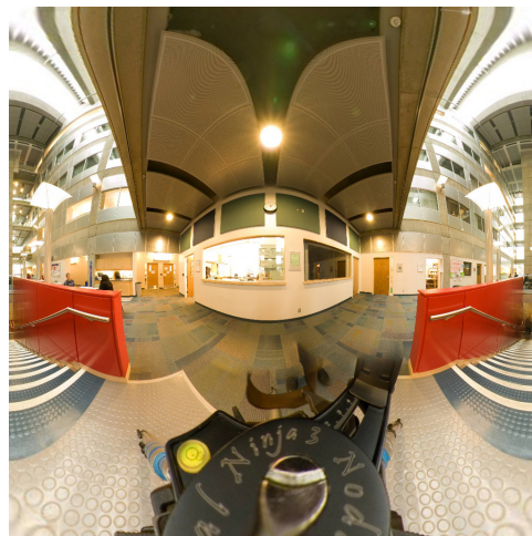
Figure 5: Adams World in a Square I. There is emphasis in the poles while maintaining the areas closer to the horizon. The tripod used to take these photos is clearly discernible. Compare this image to figure 1.

Adams presented his projections in 1925 [Ada25]. They present the entire sphere in a conformal manner. The I exaggerates the size of objects along the poles but it is otherwise a good representation of the viewable sphere. The II presents the world in a square that is rotated 45 degrees. Both can be tessellated, with aesthetically interesting results. Figure 5 shows how the poles are well represented with this projection.